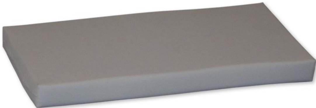
LEJRELET Pad Low

The weight is 350 g. Length is 40 5 cm, width is 30 cm and height is 14 6 cm.