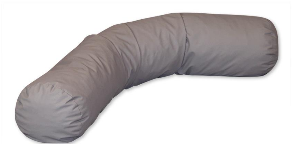
LEJRELET Tube 125

The weight is 3000 g. Length is 125 cm, diameter is 25 cm. The pad is also filled with viscoelastic foam granules.