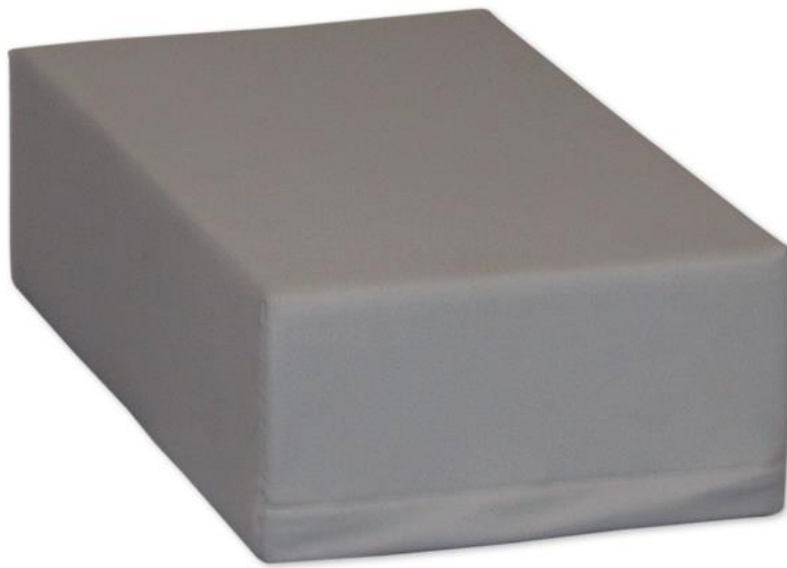
LEJRELET Pad High

The weight is 800 g. Length is 50 cm, width 30 cm and height 15 cm.